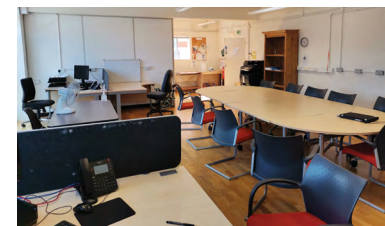
We secured extra office space in July 2020 to create safer working conditions

The year began in lockdown. We suspended face-to-face services in March, swiftly adapting to a remote-working model. Our offices stayed open for two days per week, enabling us to provide urgent support to our most vulnerable clients. We maintained a telephone advice service and stepped up emergency assistance – increasing weekly hardship payments and delivering food bank items to clients' homes.